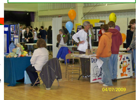
Laporte Health Fair Expo April 7th, 09